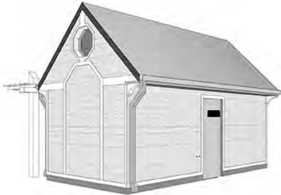
3 BUILDING BACK