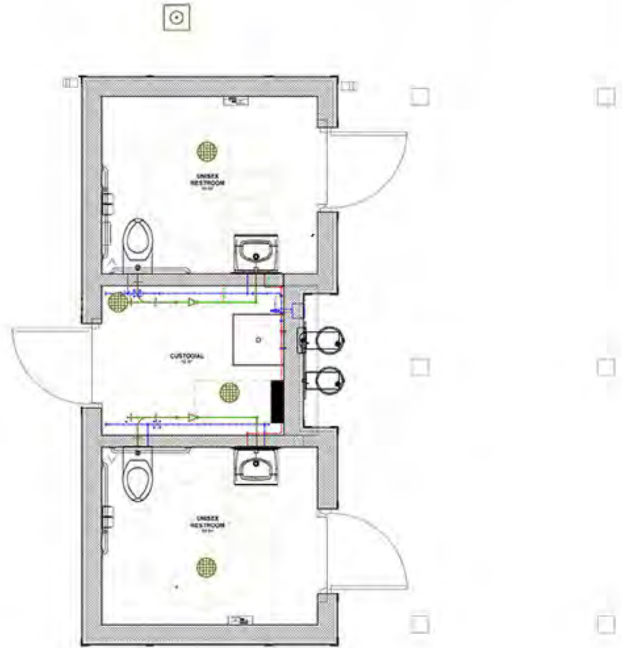
1 FIRST FLOOR PLAN